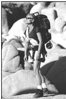
5 b..... h.....