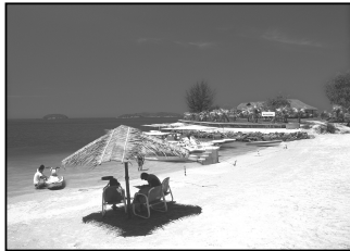
3 b..... h.....