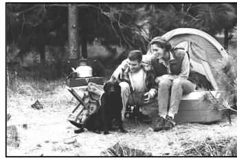
4 c..... h.....